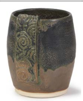
SW-140 Black Matte over SW-174