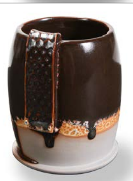
SW-149 Crackle White under SW-175